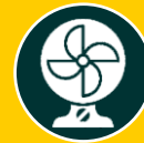
12V DC FAN